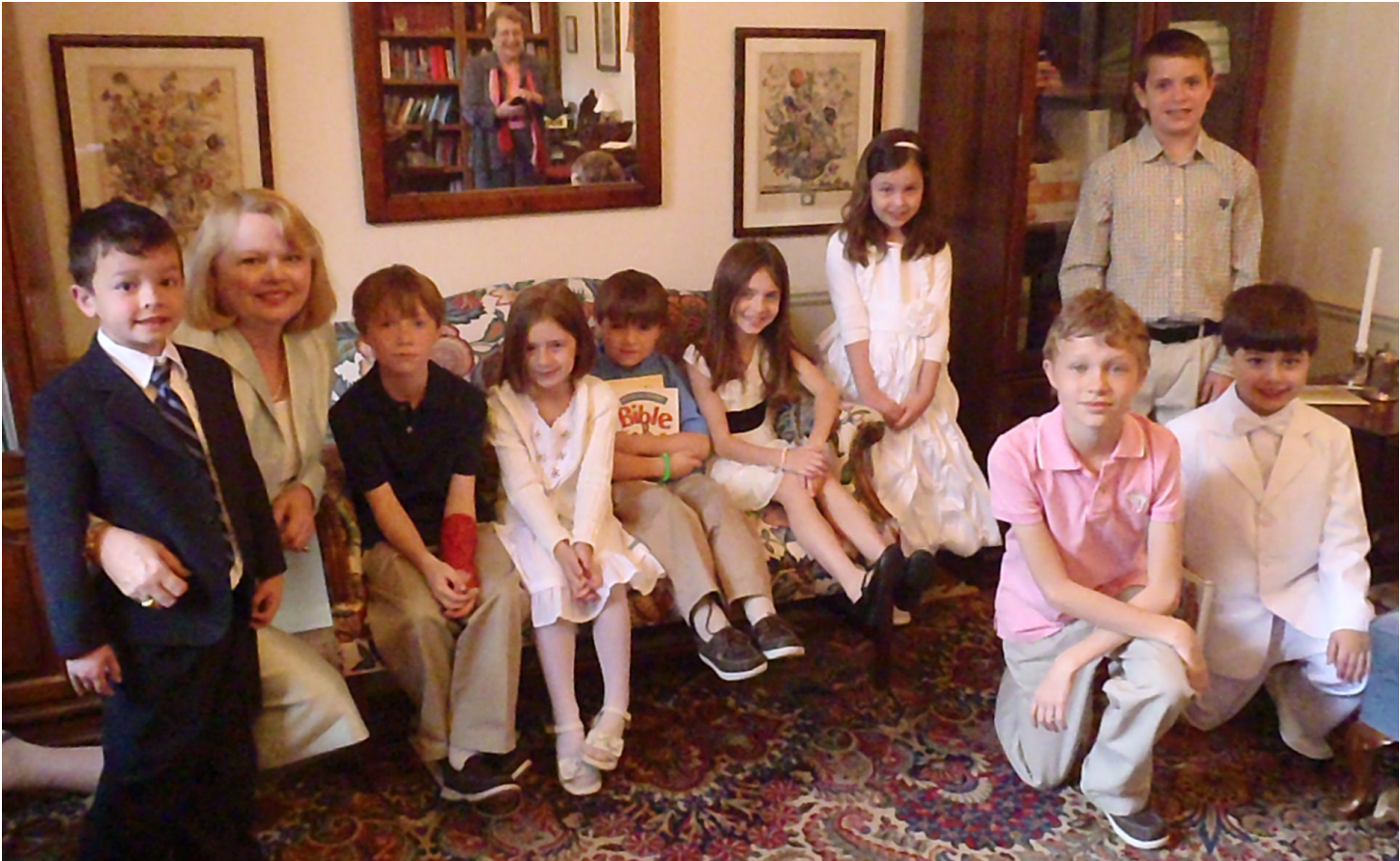
2012 FIRST COMMUNION CLASS AT SAINT JAMES—EASTER DAY

Non-Profit Org U.S. Postage PAID Grosse Ile, MI Permit No. 4