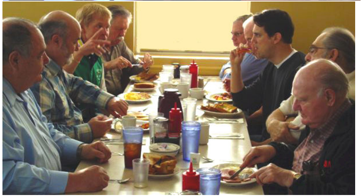
Memorial Garden in bloom...