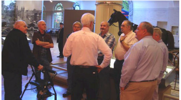
Men’s Ministry visit to Henry Ford Museum